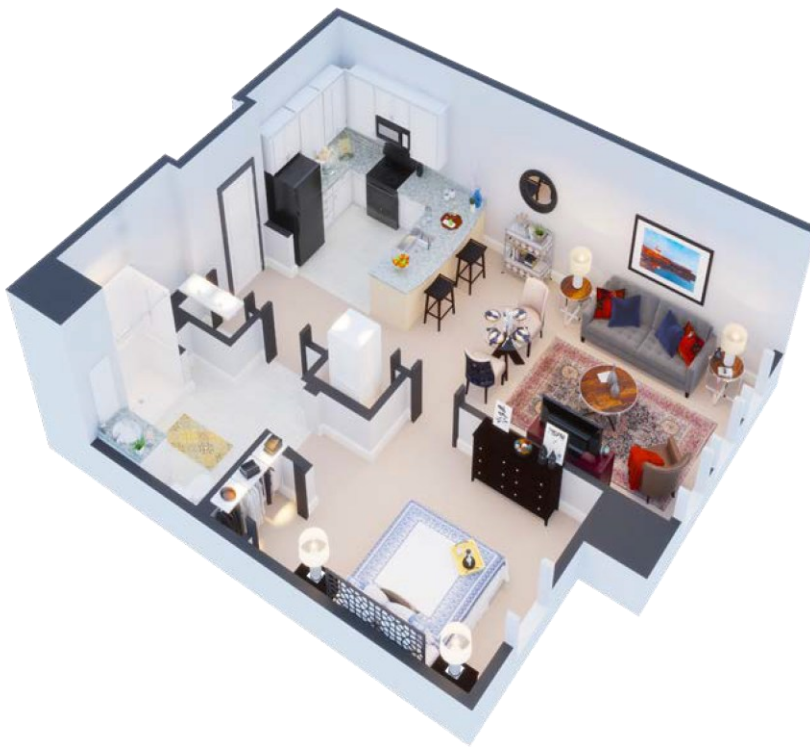
1 BDRM – 608 square feet